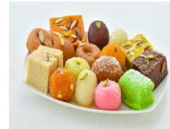
Make Mithai sweets for family