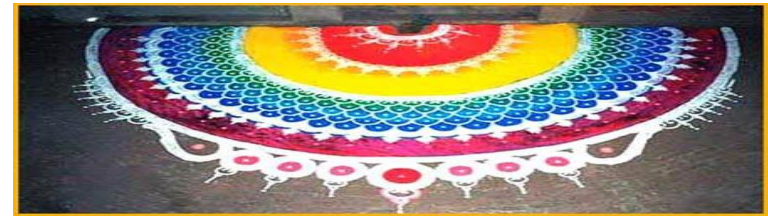
Paint Rangoli patterns on doorsteps