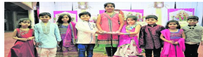
Wear new clothes