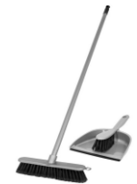
Clean their homes