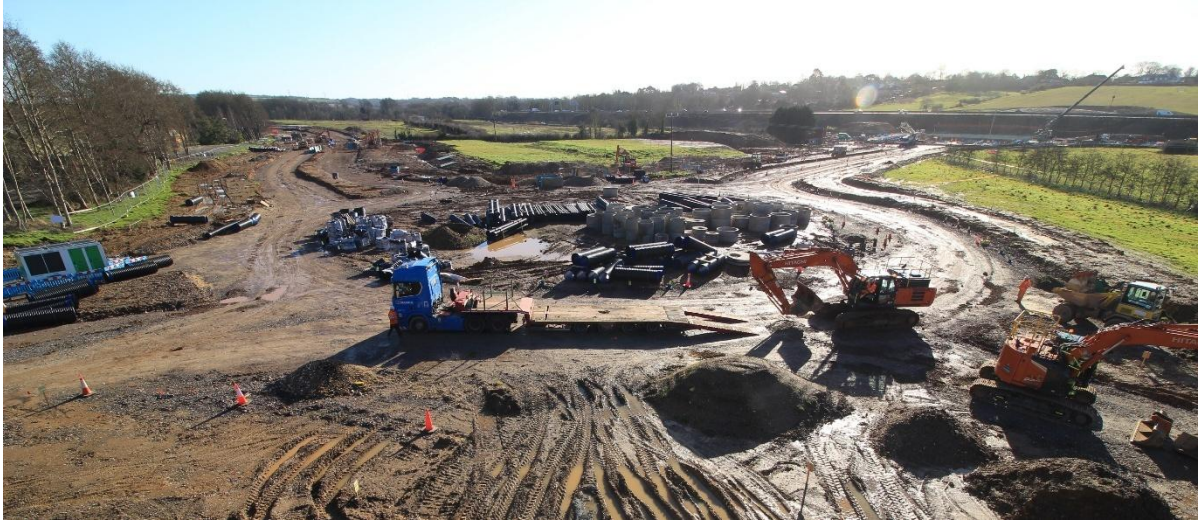
Construction of the Welborne Approach Roundabout

We would like to thank everyone for their ongoing co-operation and understanding during these works.