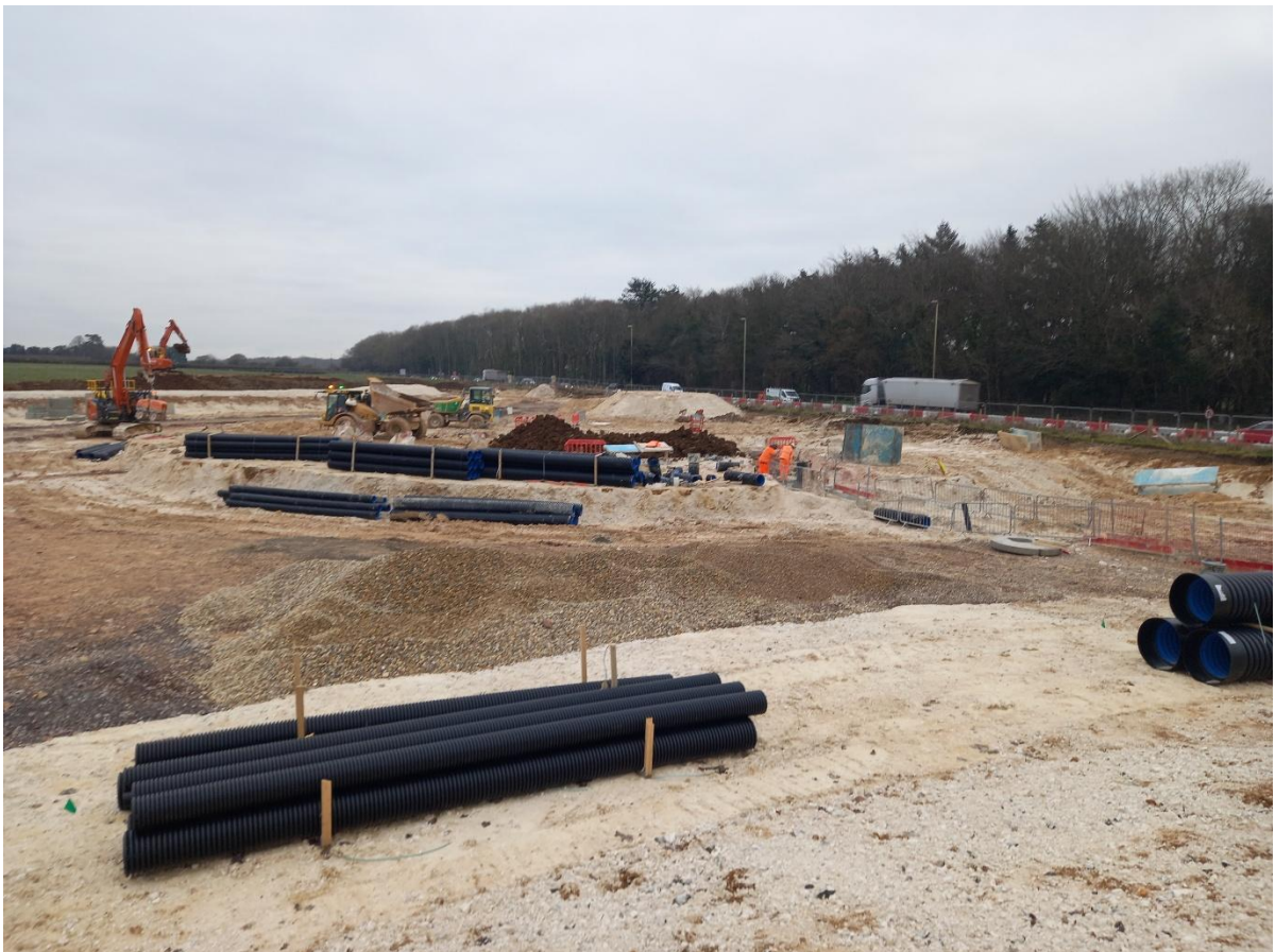
Construction of the Broadway Roundabout to connect to the west of the A32.

We would like to provide advance notice of night works which are currently being programmed for summer 2025. The A32 Junction with the western end of Pook Lane will be closed however access to Pook Lane from the M27 Junction 11 and the eastern end will still be possible. The works to construct the new A32 Broadway roundabout, which has been taking place in the field to the west of the A32, will enable changes to be made to the traffic management measures that are currently in place on the A32 north of the M27. The exact dates and details of the traffic management needed will be published in the next e-bulletin update.