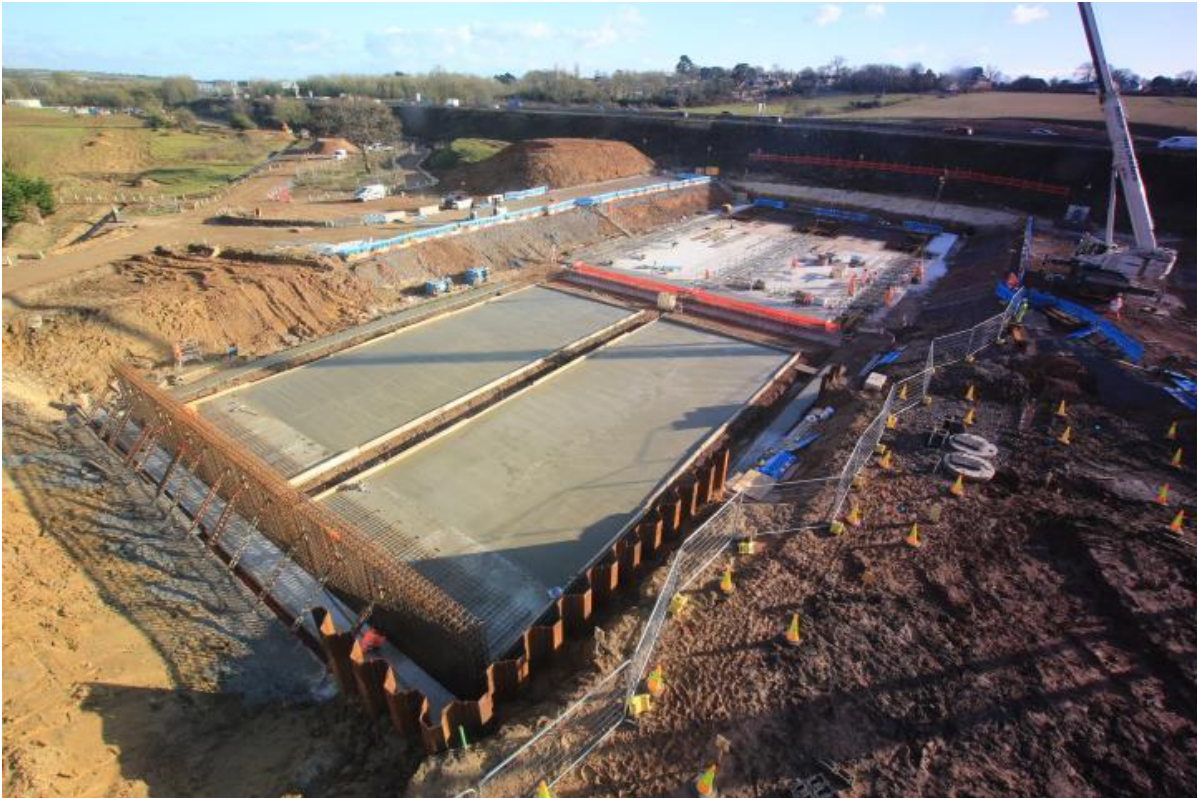
Preparation of the 'guide slab' for the box slide. This guide slab is crucial as it provides a stable and level surface on which the giant box structure will be built and eventually moved.